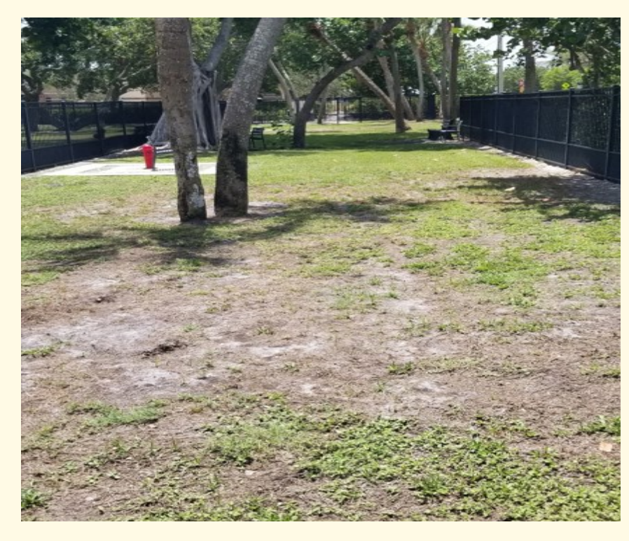
Small dog park with natural grass

K9Grass® is constructed with premium materials and installed using customized methods for long-term durability.