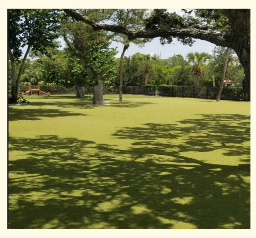
Large dog park with K9Grass® installed

The change to artificial turf has proven to be very popular with residents and guests to Longboat Key. The Town's goal for fiscal year 2024 is to complete the project by adding artificial turf to the remaining 25% of the large dog park and to completely cover the small dog park with the K9Grass®. The projected cost is $175,000.00 to complete both parks.